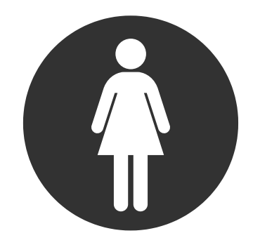
Female Hormone Panel Saliva Test